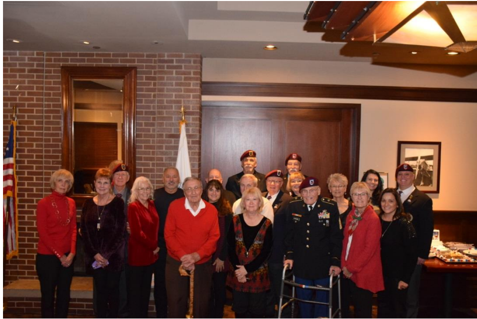
Chicago Chapter Paratroopers and their Families