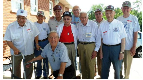
Some of our WWII Veterans – looking good, men!

More photos from the 2011 Airborne Day Picnic