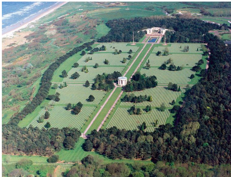
American Cemetery Normandy France